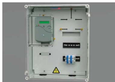
Power Meter Box