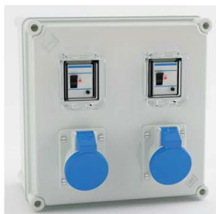
Power Plugs Box