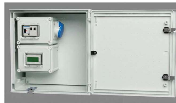
Power Plug Enclosure