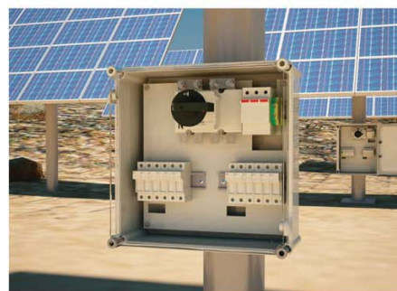
Solar Cell Plant