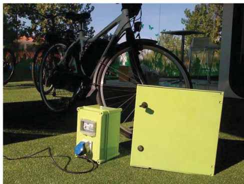
Electric Bicycle Power Charging ( Green Painting )