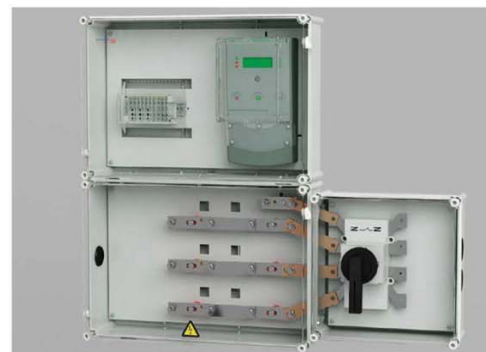
Power Busbar ( Modular System )